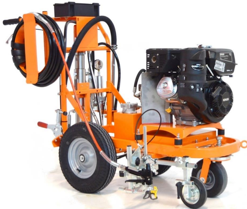
Photo doesn't show standard machine.

Dimensions: 146x64x h102 cm; Weight: 160 Kg