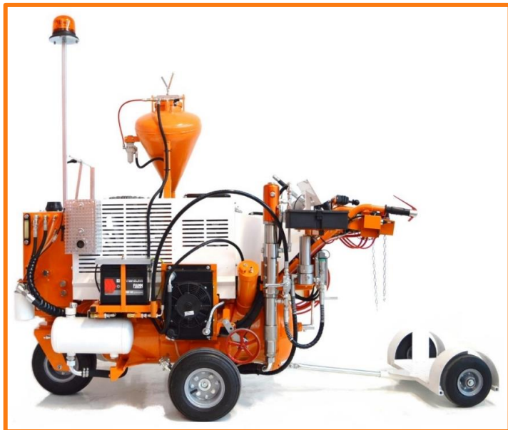
Photo doesn't show standard machine.

Dimensions: 190x80x h105 cm; Weight: 513 Kg