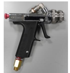
Manual paint gun-short mod. K7