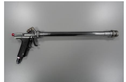
Manual paint gun-long mod. K7+P

38,5 l pressurized conic tank for glass beads (optional)