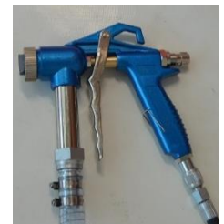
Manual glass bead gun mod. C18