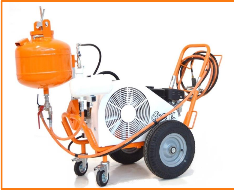
Photo doesn't show standard machine.

Dimensions: 140x65x h130 cm; Weight (standard machine without paint tank): 75 kg