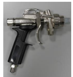
Manual paint gun-short mod. 5