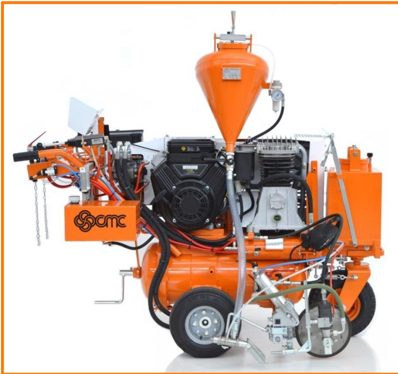
Photo doesn't show standard machine.

Dimensions: 175x80x h120 cm; Weight: 360 Kg